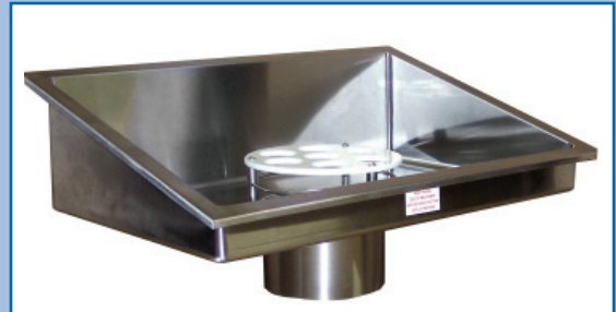
STAINLESS STEEL COVERED FEED TRAY