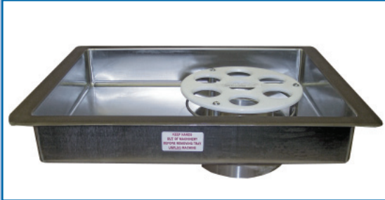
LOW PROFILE STAINLESS STEEL FEED TRAY