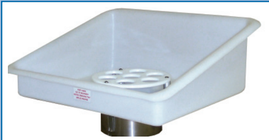
PLASTIC COVERED FEED TRAY